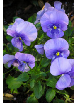
When God created the world, "it was good."

God created all of this over the course of six days, and each time he created something, "God saw that it was good."